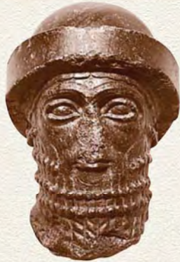
Hammurabi ? –1750 B.C.

The noted lawgiver Hammurabi was also an able military leader, diplomat, and administrator of a vast empire. Hammurabi himself described some of his accomplishments: