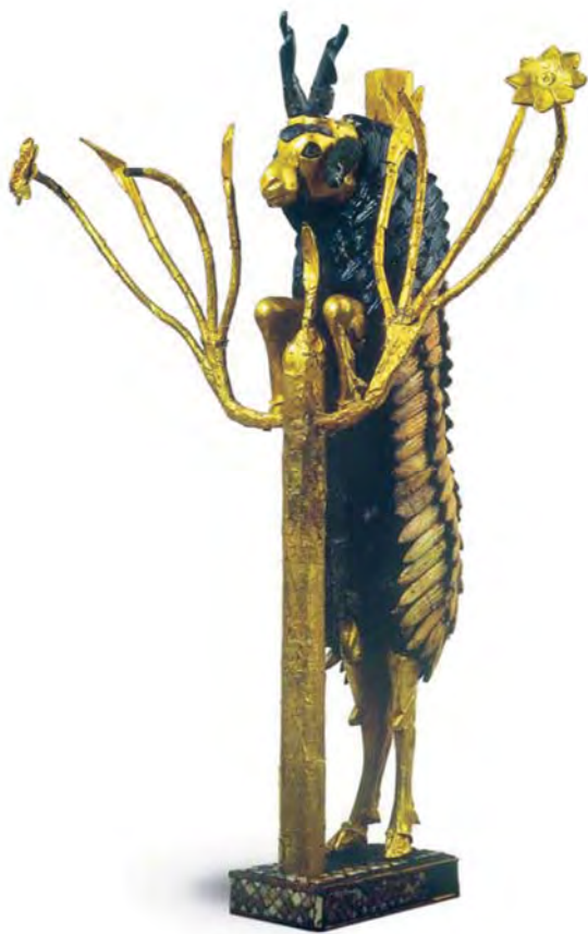
▲ This gold and lapis ram with a shell fleece was found in a royal burial tomb.

Sumerians built impressive ziggurats for them and offered rich sacrifices of animals, food, and wine.